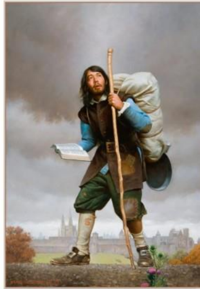
Christian looks for a way of escape outside the City of Destruction.